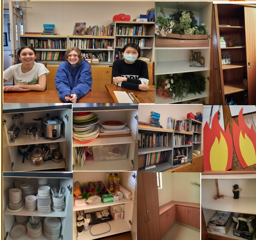
Mercy Catholic College Outreach Program 2022